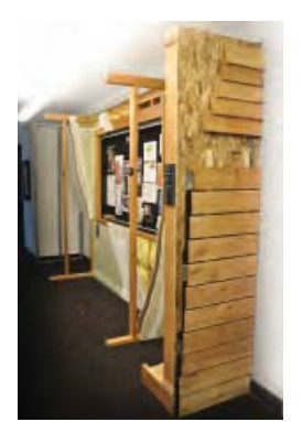
full-scale sample walls

Advanced Adaptive Reuse Studio Advanced Global Design Studio Advanced Interior Detailing Advanced Kitchen and Bath Advanced Residential Studio Building Codes and Accessibility Design Computer Rendering Drafting II Portfolio II Presentation Graphics Sustainable Design